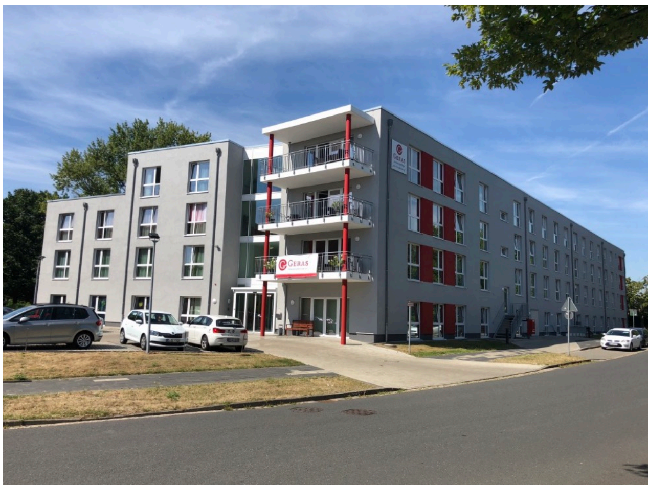
SENIORENPFLEGE "AM FREDENBERG" - SALZGITTER